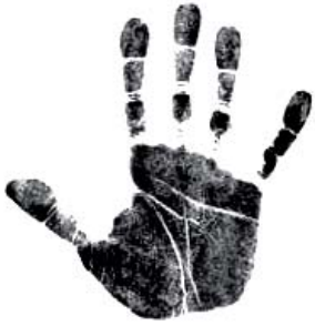
Handprint where germs are most commonly found

Individuals with poor hygiene standards will transfer germs to an ATM or chip & pin machine surface by not washing their hands properly after doing everyday tasks such as using a washroom, emptying the bin, touching raw meat or changing nappies, all of which can contaminate the hands. Bacteria and viruses are then able to survive in the tiny grooves and cracks on surfaces for long periods of time 1,9,10 lying in wait until they can be transferred to a more suitable growth environment i.e. you!