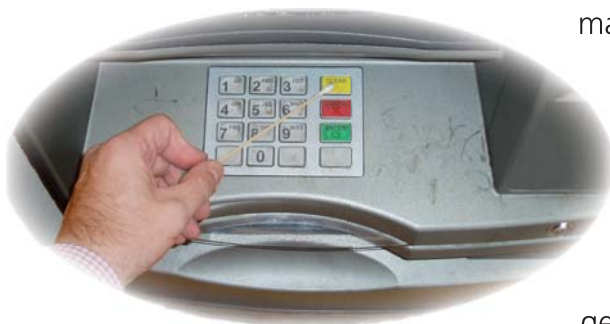
Taking a swab from an ATM machine

including Shigella spp. which can cause severe gastroenteritis. Chip & pin machines were also found to be contaminated with enteric bacteria 6 . So every time you use an ATM or chip & pin machine you can pick up not only your cash, but also the many germs surviving on the keypad and slots.